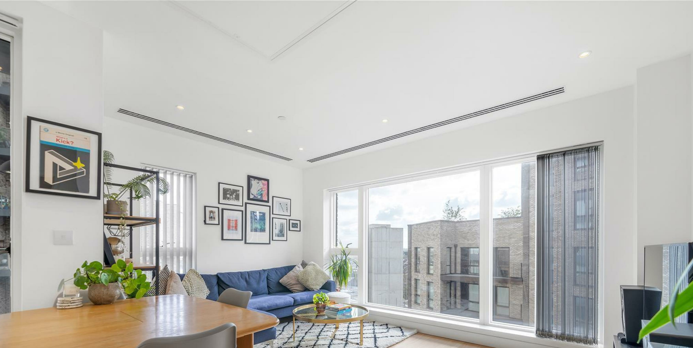
Rainier Apartments, Croydon CR0